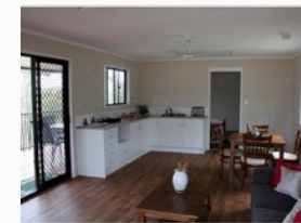
Lakeview has microwave, fridge, glasses, etc.

Our air conditioned Lakeview cabin has one queen size bed, and can comfortably accommodate two guests. Arrangements can be made for accommodation for a maximum of four guests. For detail regarding additional guests telephone 07 5463 6256.