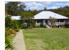
An ideal venue for social or family groups & gatherings.

Own & enjoy a beautiful and unique family Queenslander homestead for 2 days, 3, 4 or more . . . bring your friends, mates and family . . . spoil yourself and your mates . . . and experience the atmosphere: enjoy the vista of mountains, lake and bushland; or sip wine and from your verandah watch a waterskier crossing the lake in the distance; or take pleasure in picnicking in the homestead grounds.