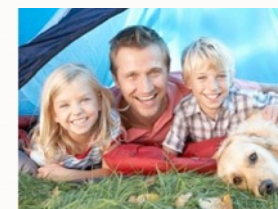
All the family: don't leave your pet at home.

Our camping facilities include an amenities block with hot showers, a camp kitchen with dish washing facilities. Our camping sites are much larger than normal city sites. Family groups and friends are able to camp alongside each other and to position tents and caravans in a manner that pleases them best. We have four camping areas: the Billabong area, the Maroon Cove, the Hidden Ridge, and our mountain bush camps.