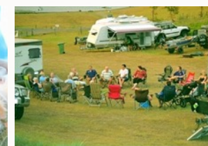
All camp sites have plenty of space: mates can join you.