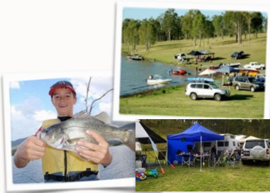
Lake Maroon is rated as one of Queensland's best-stocked Bass fishing impoundments.

We have our own private access to the lake. This private area is exclusively for Lake Maroon Holiday Park guests, and is free to Lake Maroon Holiday Park guests. Guests can tie-up or anchor their boat or yacht overnight at the water's edge in a secure environment. Likewise, jet skis can be left safely at the waters edge overnight. At night our lakeside area is locked off.